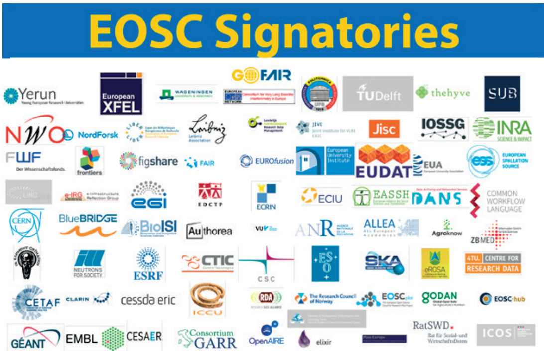
Figure 3 – The 70+ signatories of the EOSC declaration

Those involved who are key to the implementation of the EOSC, confirmed the relevant role played by the ‘coalition of doers’ and encouraged momentum to be maintained; this led to the submission of over 70 endorsements/commitment letters as a result of the EOSC declaration, see the figure below.